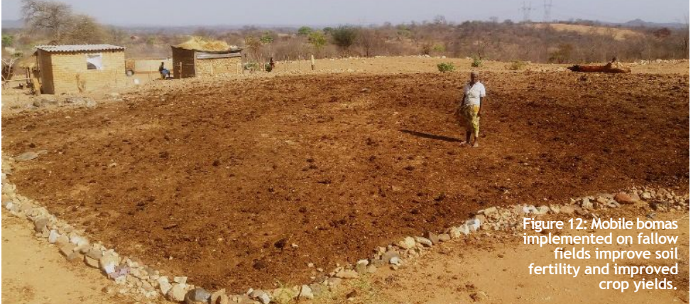
Figure 12: Mobile bomas implemented on fallow fields improve soil fertility and improved crop yields.