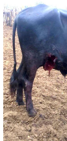
Figure 2: A steer that survived mauling by predators.

All large predators; African lion, cheetah, leopard, African wild/painted dog and spotted hyena, hunt or prey on wild animals. With the increasing human-wildlife interface, and livestock's proximity to PAs and its inability to escape as fast as wild prey species, livestock become an easier prey for predators. This can, in many instances lead to development of habituated behaviour of predators switching from wild prey to livestock. This can be devastating on the small scale traditional farmers who depend on a few livestock and can thus become a significant problem at the local levels and induce drastic human retaliation, and negative implication on the predator population. In order to address the HWC and apply appropriate mitigation measures one must understand the behavioural characteristic of the predator.