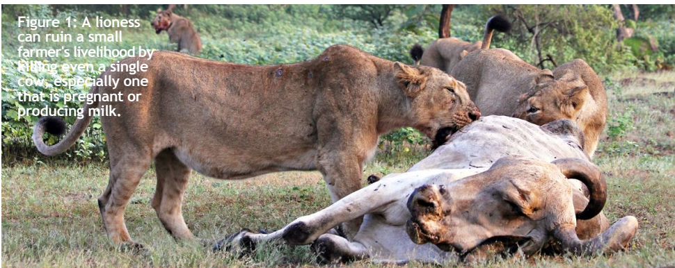
Figure 1: A lioness can ruin a small farmer's livelihood by killing even a single cow, especially one that is pregnant or producing milk.

KAZA TFCA, the world's largest transfrontier conservation area in the world, is an extremely important conservation landscape for large predators particularly the African lion ( Panthera leo ), cheetah ( Acinonyx jubatus ), leopard ( Panthera pardus ), African wild dog ( Lycaon pictus ) and spotted hyena ( Crocuta crocuta ). These predators are also a key attraction for the tourism industry in the KAZA landscape, therefore their persecution because of livestock depredation can have negative impacts not only on the ecological processes, but on the tourism industry as well. In order to reduce and mitigate the undesirable results of interactions between humans and large predators, there is need to provide information to all stakeholders in KAZA TFCA on various methods that may enable more harmonious coexistence of people and these animals.