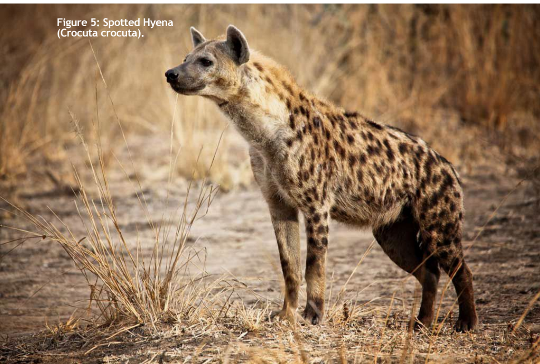
Figure 5: Spotted Hyena ( Crocuta crocuta ).