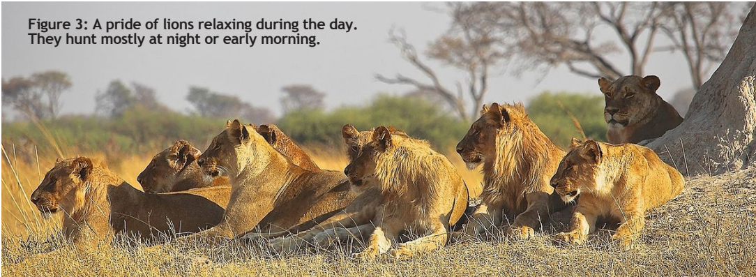
Figure 3: A pride of lions relaxing during the day. They hunt mostly at night or early morning.