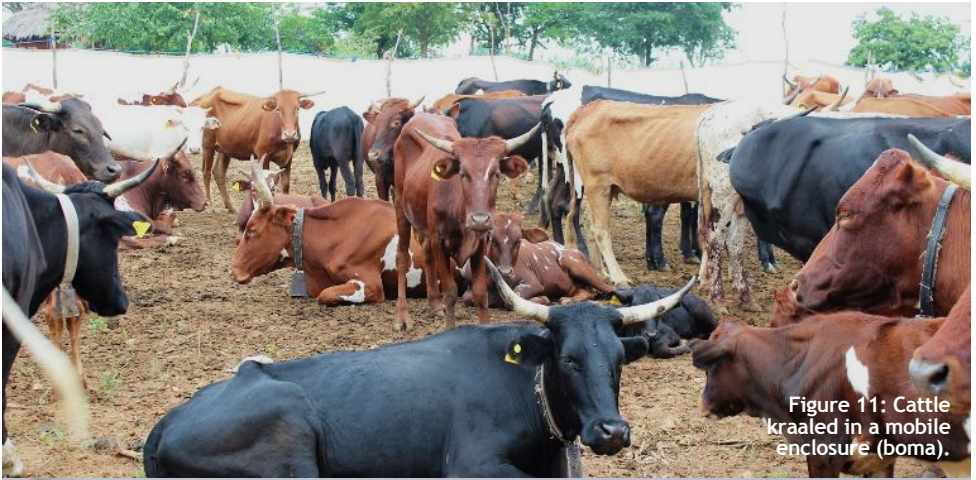
Figure 11: Cattle kraaled in a mobile enclosure (boma).