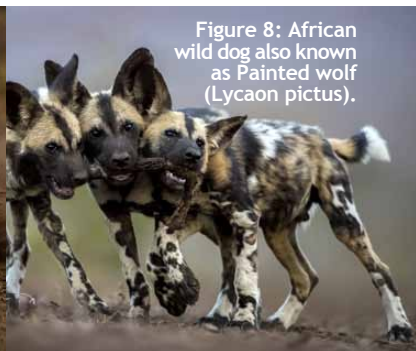
Figure 8: African wild dog also known as Painted wolf ( Lycaon pictus ).