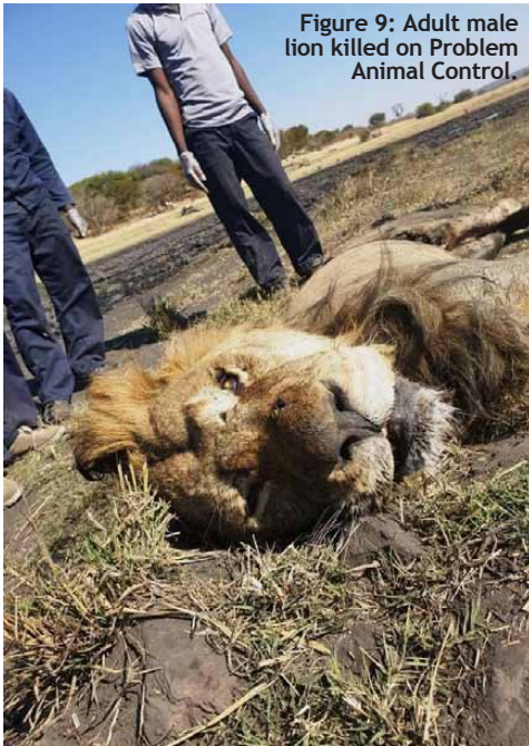
Figure 9: Adult male lion killed on Problem Animal Control.

Unprovoked attacks may be classified as natural risks associated with predators such as true predation on humans, especially on small children. These types of attack are also risks associated with humans' activities such as when people walking at night surprise lions that may attack them. Attacks on humans can also be done by old animals, particularly lions, which are weary, frail, and unable to catch wild prey.