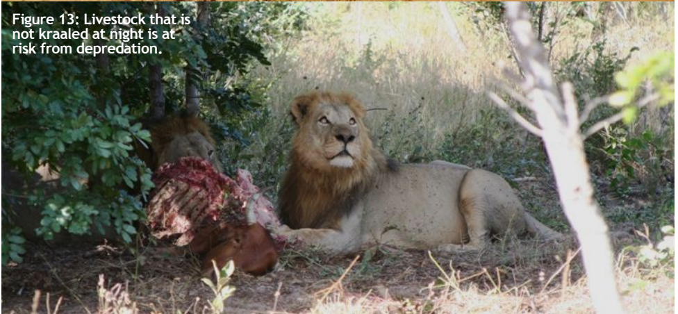
Figure 13: Livestock that is not kraaled at night is at risk from depredation.