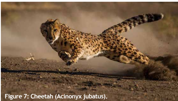
Figure 7: Cheetah ( Acinonyx jubatus ).