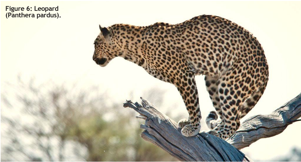
Figure 6: Leopard (Panthera pardus).