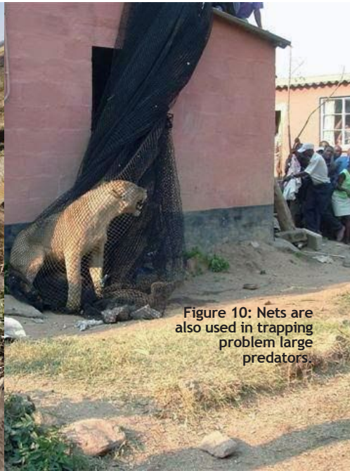
Figure 10: Nets are also used in trapping problem large predators.